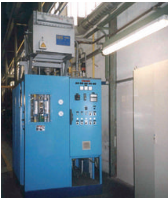
The Endolin process: tried and tested in pipe production.

This and many other brochures can also be downloaded from the Internet in PDF format: www.messergroup.com