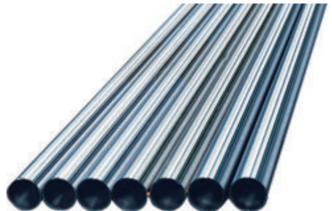
Dazzling results with optimised Endolin

separately at different points of the heat treatment facility, leading to different hydrogen and carbon monoxide contents in the heating chamber and cooling tunnel. A special nitrogen injection system in the cooling zone also allows a flow to be generated which markedly reduces unwanted dust deposits.