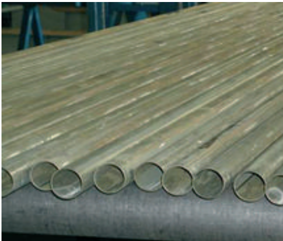
Endolin field-test : before annealing and ...