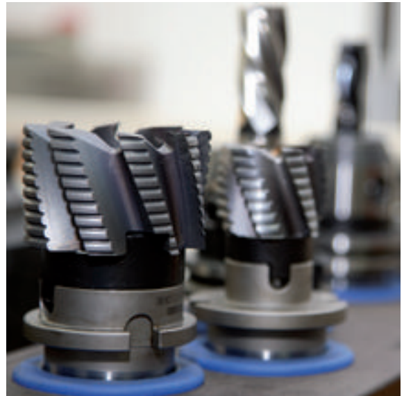
Targeted wear protection for long service life

This and many other brochures can also be downloaded from the Internet in PDF format: www.messergroup.com