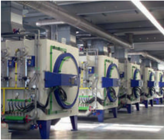
Modern nitriding furnaces at IVA